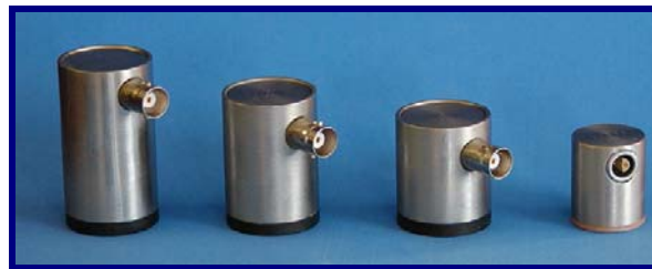
Integral preamp sensors (60, 150, 400 kHz) and differential sensors (375 kHz), miniature sensors.